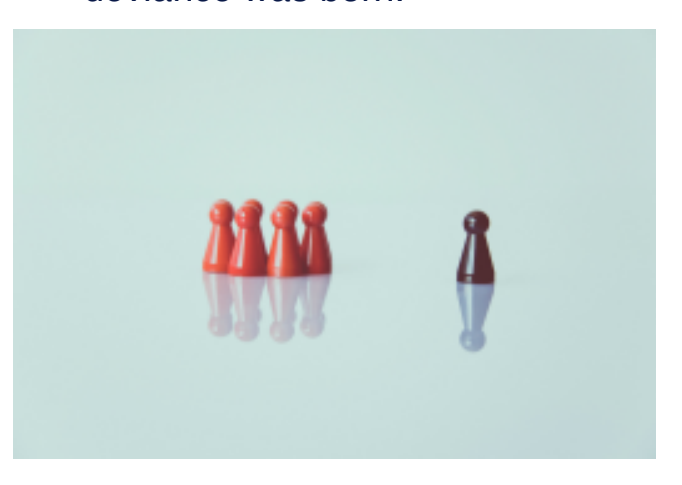
Author: Markus Spiske

that give success in other places, they had no money. They had to approach the problem differently and they did. They went to the village and talked with the people about which children were the best fed and what solutions their parents used. This is how the approach of positive deviance was born.